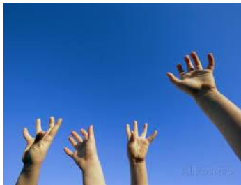
Mrs. Horton Classroom Volunteers

*Click on the Link below to find out more info and sign up to help out.