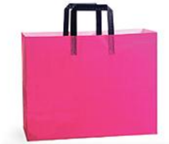
Gala Pink Project Bags