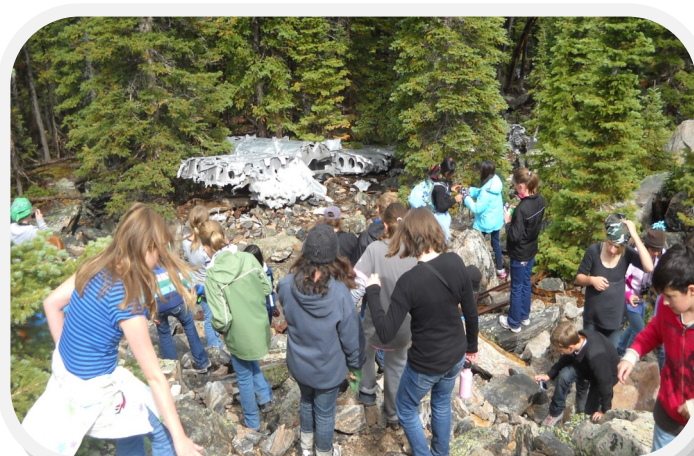
Students exploring at the B-17 bomber site