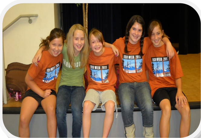
Friends getting ready to embark on their three day journey.