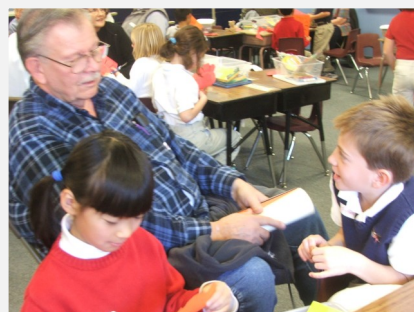
Liberty grandparent and students enjoy each other's company during Grandparents' Day 2010.